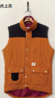
MOUNTAIN EDITION TAME VEST VN-0TJR8BJ RMB 990 / 10月上市