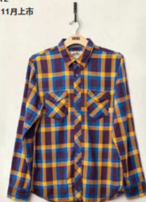
EDGEWARE VN-0UVB9Y2 RMB 460 / 11月上市