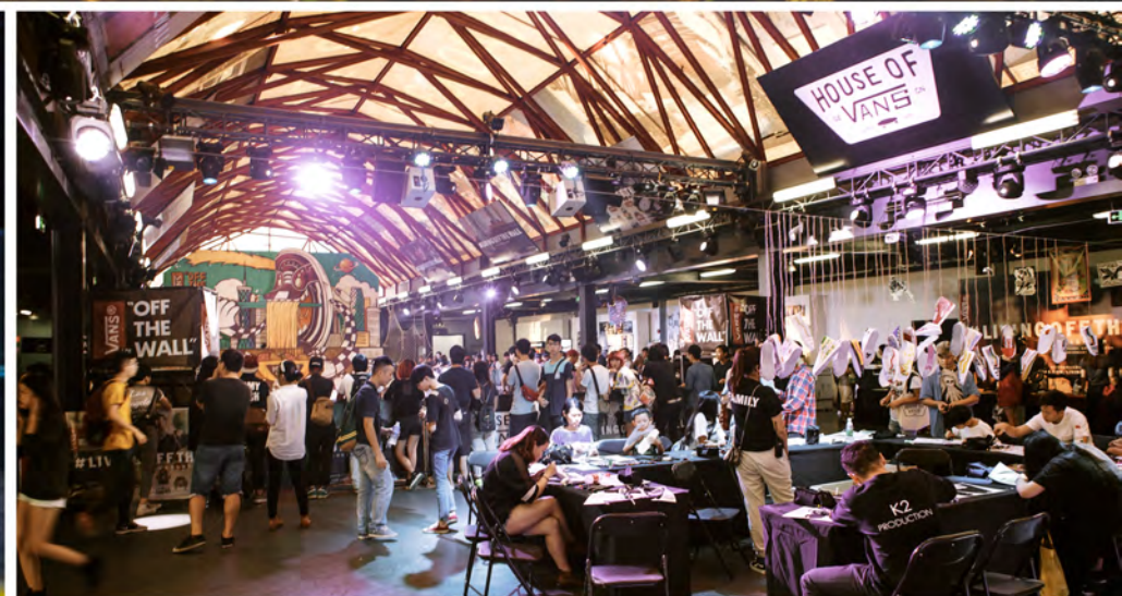
HOUSE OF VANS | GUANGZHOU OCTOBER 2014