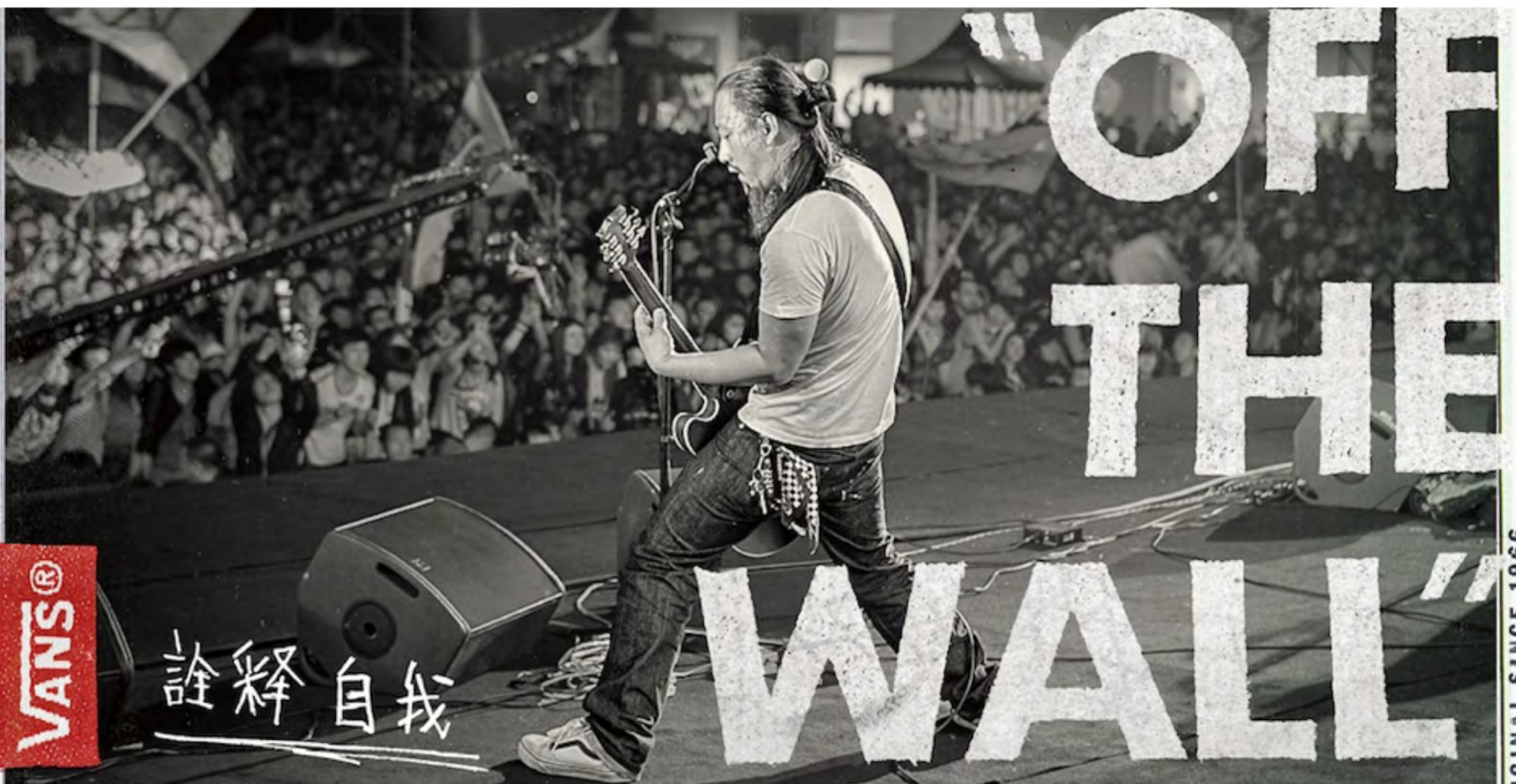
OFF THE WALL AD 2013