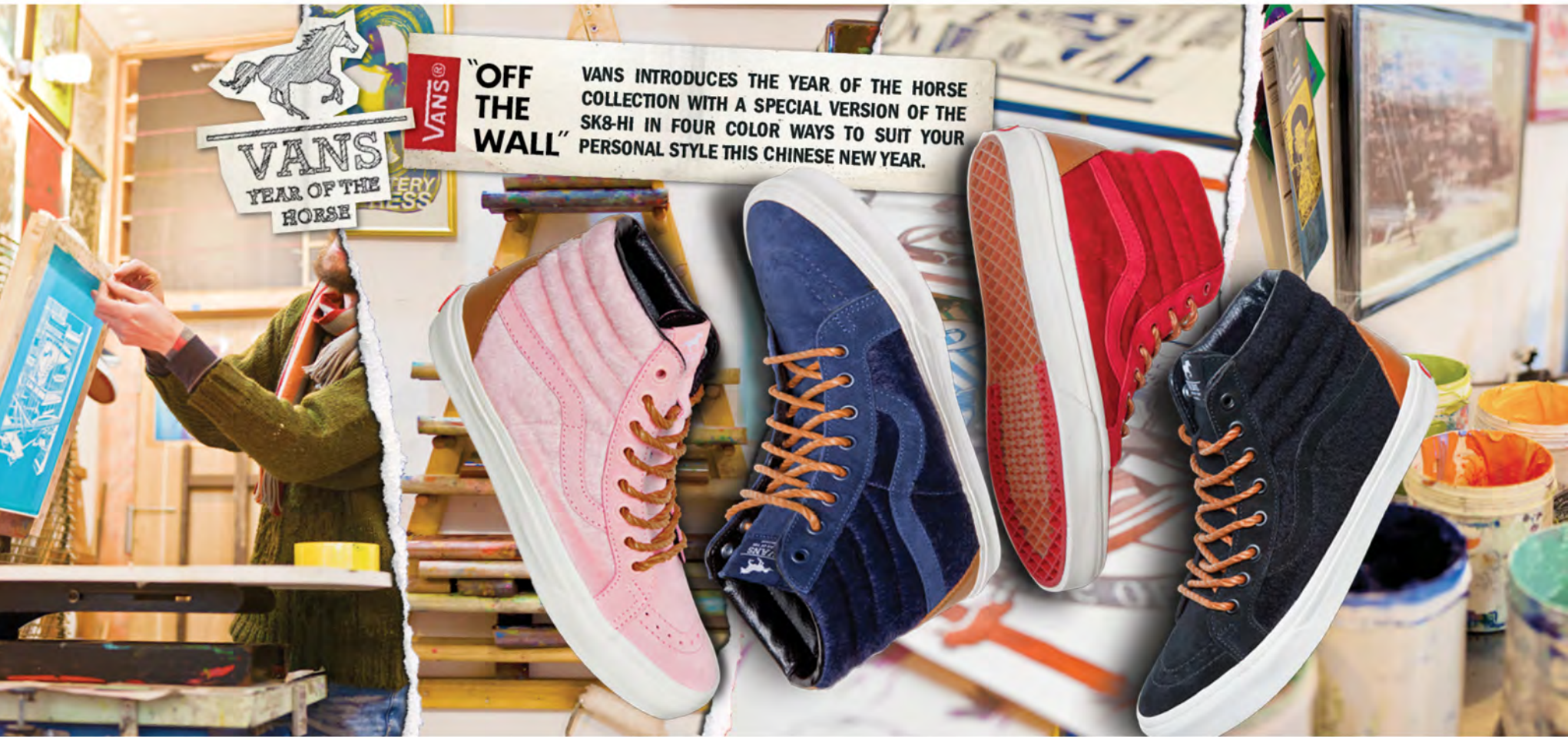
year of the horse ad | spring 2014