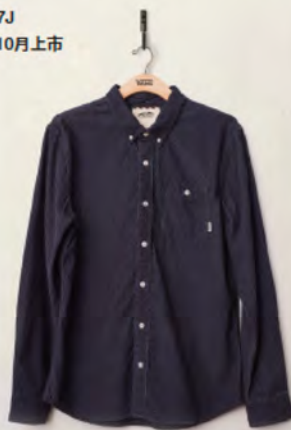
VN-0UM097J RMB 460 / 10月上市