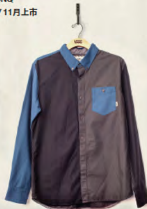
HESTER VN-0UN09NQ RMB 460 / 11月上市