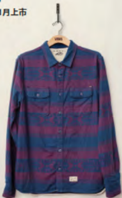
HOOVER VN-0U4J98W RMB 460 / 11月上市