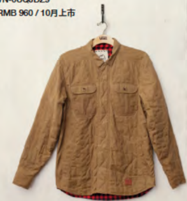
TANKA MOUNTAIN EDITION VN-0UQJDZ9 RMB 960 / 10月上市