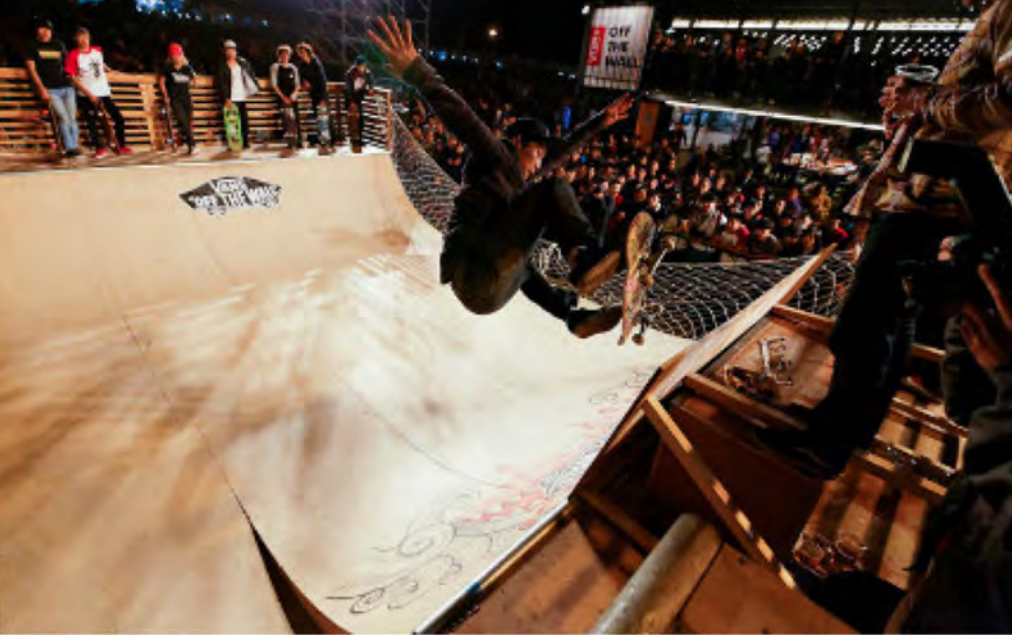
HOUSE OF VANS | MIDI FESTIVAL BEIJING 2014