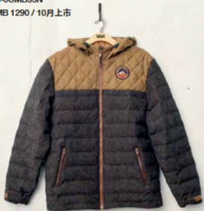
BRIDGER JACKET II VN-0UMB95N RMB 1290 / 10月上市