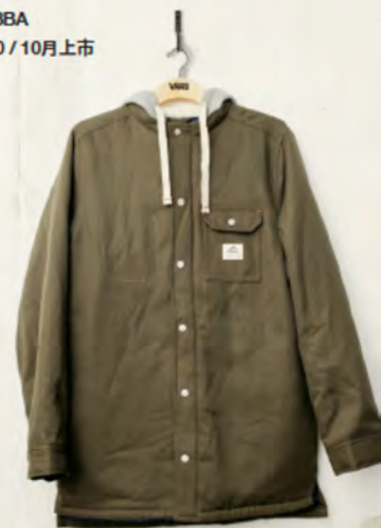
VN-0TJQ8BA RMB 1290 / 10月上市